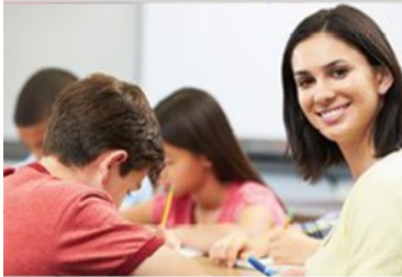
New Chapters & New Advisers

NEHS CONSTITUTION | NEHS HANDBOOK | RESOURCE DIRECTORIES | LOGO USAGE | GLOSSARY | PRESENTATIONS