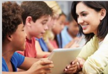
Working with Members & Officers